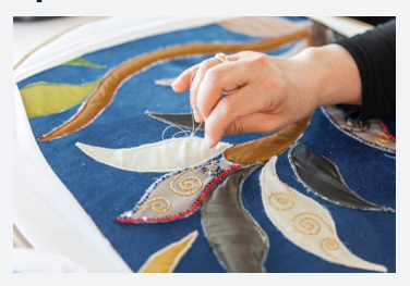
Faith-Based Services & Music, Devotionals, Prayer, Meditation, Quiet Spaces, Religious Observances