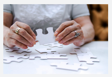
Trivia's, Educational Presentations, Science Experiments, Historical Programs, Nature-Based Programs, Art/Music History Appreciation, Book Club, Music Therapy